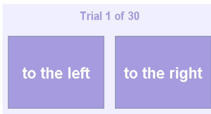
Figure 1. Example of applet response box

The finding that the localisation cue was hardly affected by the MP3 coding indicates that this cue may well be the time differences between the left and right stimuli.