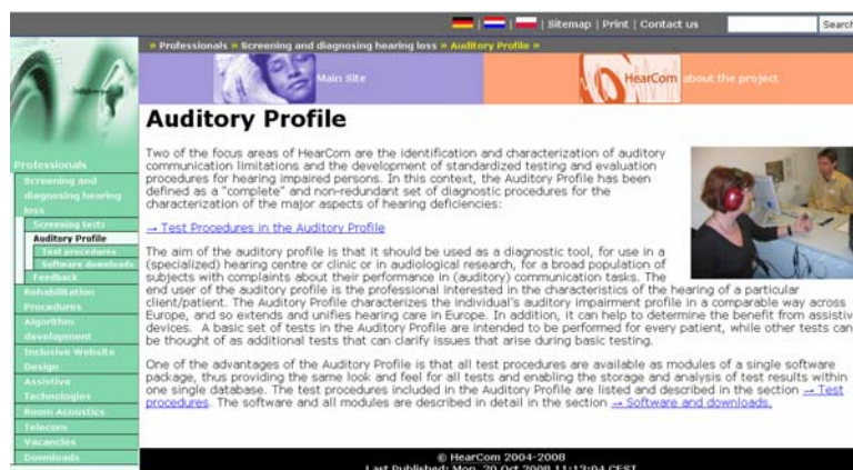
Figure 1: Page informing about the Auditory Profile and linking to more detailed information.

The subpage “Auditory Profile” offers general information about the HearCom diagnostic test battery and provides links to detailed information about the individual diagnostic tests and the demo software downloads.